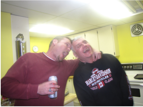
The sing - a - long Gang